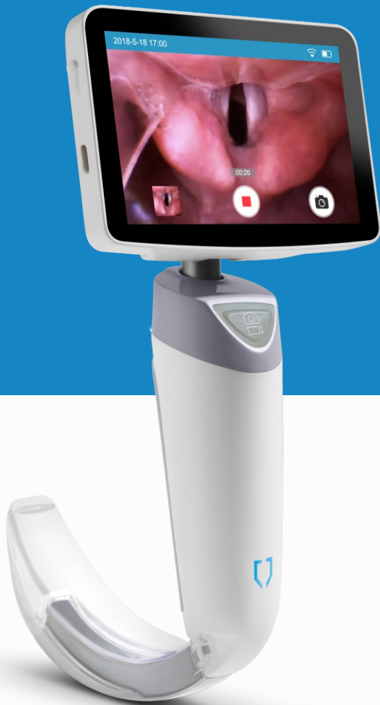
Video Laryngoscope VS-10 H