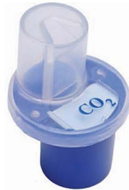
Neo-StatCO 2 <Kg 0.25 kg to 6 kgs body weight