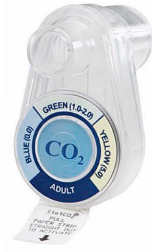
StatCO 2 Over 15 kgs body weight

All CO 2 Detectors are Single-Patient-Use