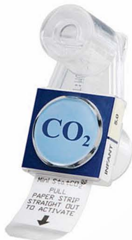
Mini StatCO 2 1 - 15 kgs body weight