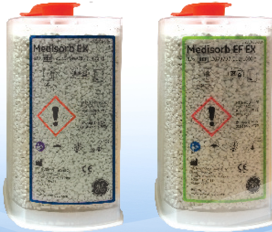
Medisorb™ EX and EF EX soda lime CO 2 absorbent for GE Carestation™ 600 series