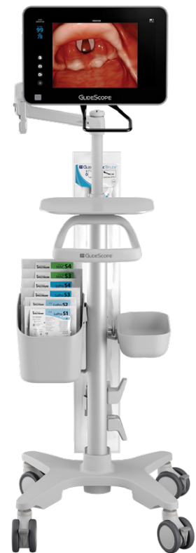
GlideScope Core 15 with GlideScope Core Premium Workstation