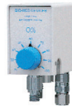
HIGH FLOW with single bottom output