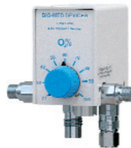
LOW FLOW with two side outputs