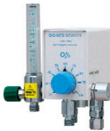
LOW FLOW with 15 lpm flowmeter, bleed switch and bottom output