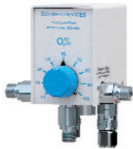
HIGH/LOW FLOW with three outputs