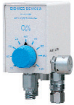
MID-FLOW with bleed switch and bottom output

To learn more, visit www.biomeddevices.com , or call the number below.